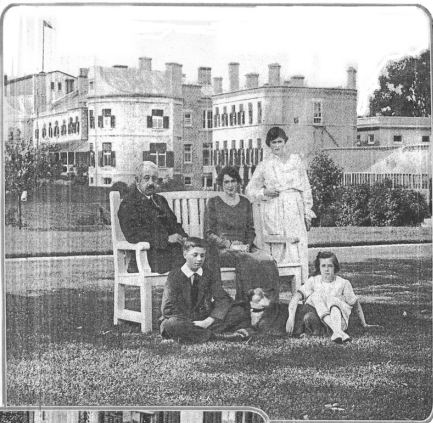
First among the distinguished persons who entertained the royal English Prince during his stay in Ottawa was, of course, the Duke of Devonshire, Governor-General of Canada. He is seated on the lawn before the Government House with Lady Dorothy, Lady Rachel, Lady Anne, and Lord Charles