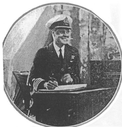
The Prince of Wales, with an air of one well contented with his surroundings, signed the guest's register at the Studley Quoit Club in Halifax