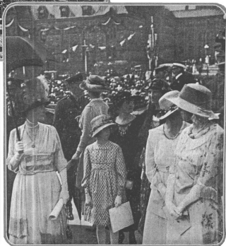
(Above) At the garden-party given for him at Government House by the Duke of Devonshire, the Prince met many noted members of Ottawa society. He is shown standing beside the Duchess of Devonshire, while at the left, the Duke of Devonshire is greeting Sir Arthur Currie