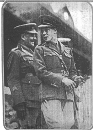
(Right) In Toronto, where the Prince of Wales spent several days en route to the Pacific, he attended the Canadian National Exhibition on Veterans' Day, August twenty-fifth